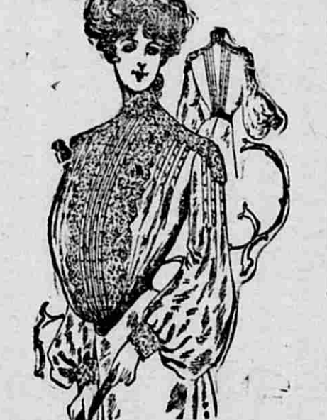
4662 Blouse Waist, $2 to 40 bust. Box Plaited Waist 4662

To Be Made With or Without Epaulettes and Fitted Lining. Narrow box plaits are much in vogue and are always effective. The novel blouse illustrated shows them used in groups and is both eminently simple and smart.